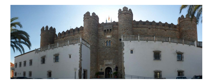
Figure 2. A modern panoramic view of the main facade of the Alcázar de Zafra nowadays. From this palace, Count Don Pedro observed the ball lightning.

Figure 1. The town of Zafra in about 1660. The two important buildings on the left-hand side of the image are the Santa Clara Convent (first on the left) and the Alcázar de Zafra (second on the left). The important building in the central part of the image is the Collegiata church. The "Peñas del Castellar" mentioned by Fr. Joseph de Santa Cruz are the highest hills seen on the left of the image.